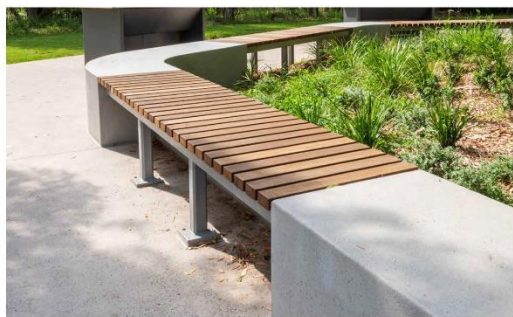
Example of new bench seating