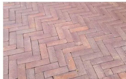
Example of new brick paving