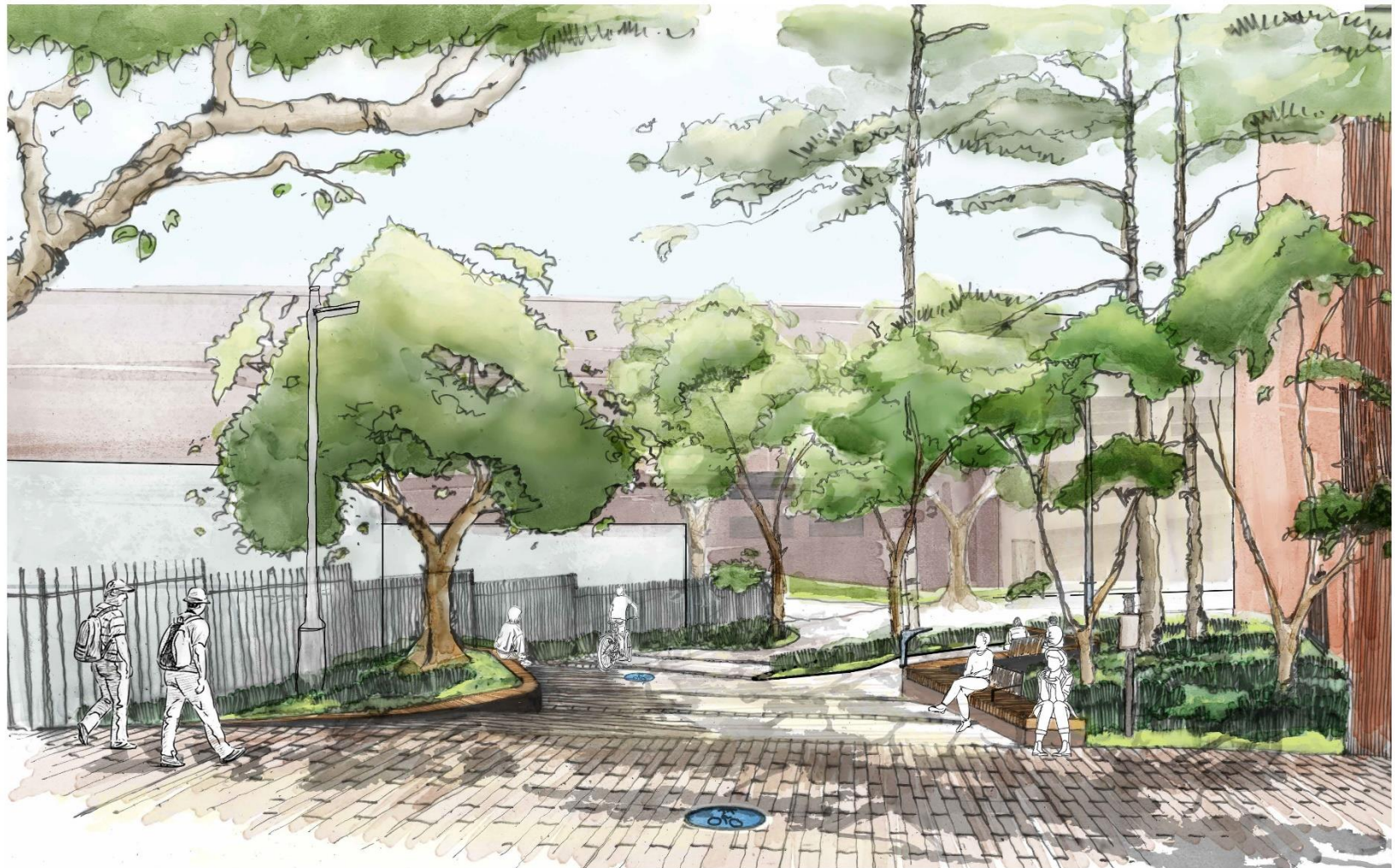
Artist impression of the new upper Cooper Street Reserve looking from Riley Street

We invite your feedback on the proposed concept design.